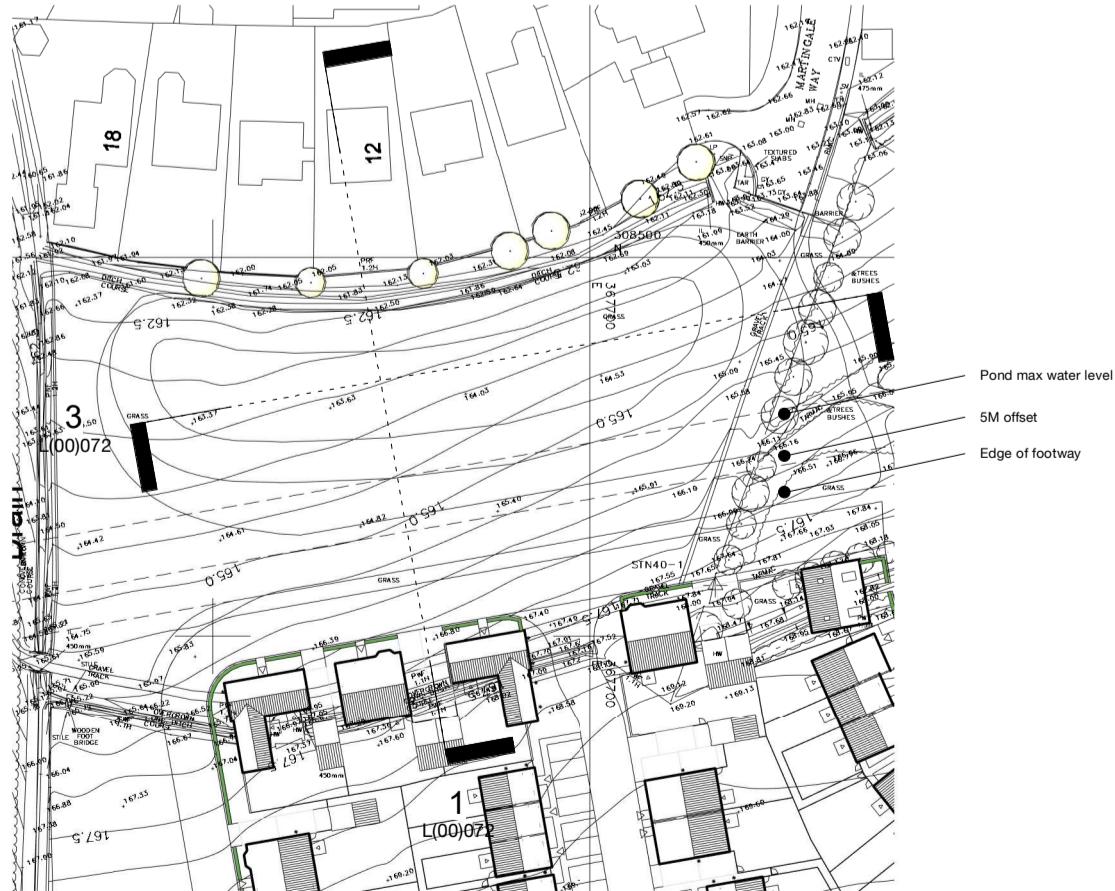
Section Key Plan 1 : 1000

Notes: © Origin3 Studio Ltd THIS DRAWING IS NOT TO BE SCALED. EXCEPT FOR THE PURPOSES OF PLANNING APPLICATIONS AND FOR LEGAL PLANS WHERE THE SCALE BAR MUST BE USED. ALWAYS REFER TO FIGURED DIMENSIONS. CONTRACTORS, SUBCONTRACTORS AND SUPPLIERS MUST VERIFY ALL DIMENSIONS ON SITE BEFORE COMMENCING ANY WORK OR MAKING ANY SHOP DRAWINGS. THIS DRAWING IS TO BE READ IN CONJUNCTION WITH STRUCTURAL, MECHANICAL AND ELECTRICAL ENGINEERS DRAWINGS AND ALL DISCREPANCIES ARE TO BE REPORTED TO THE ARCHITECT.