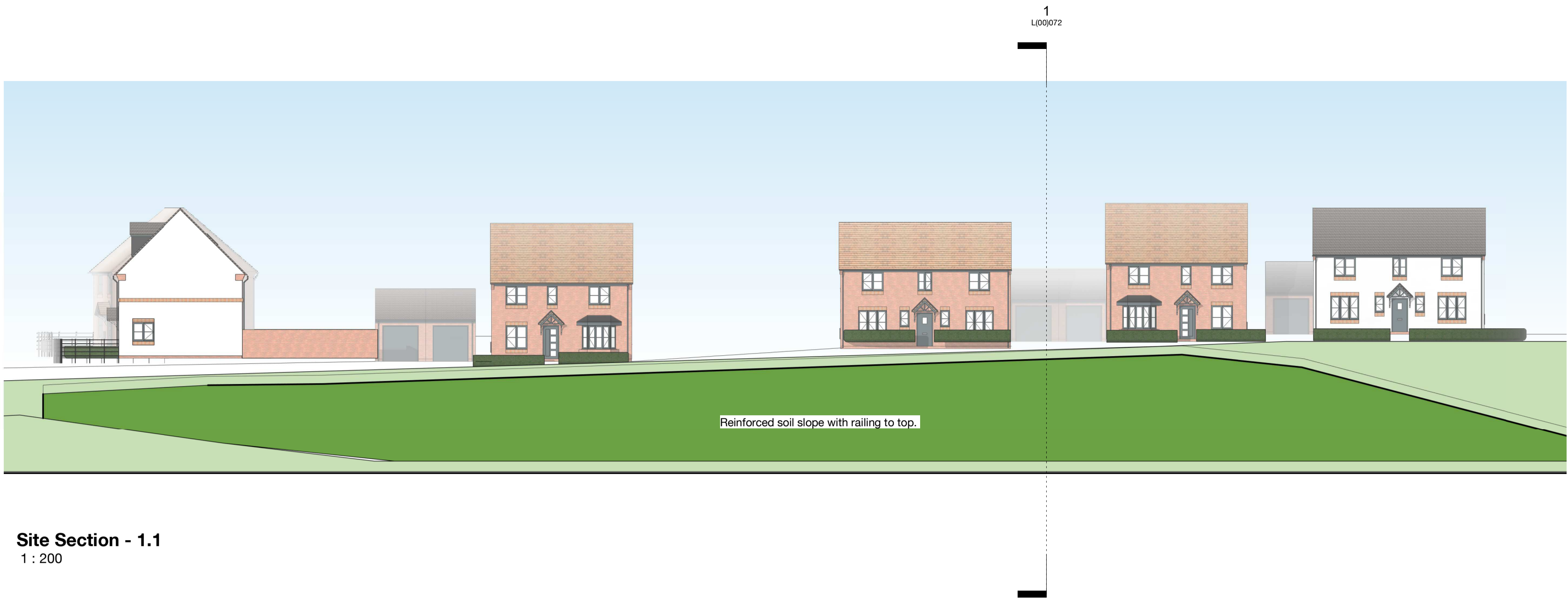
Site Section - 1.1 1 : 200