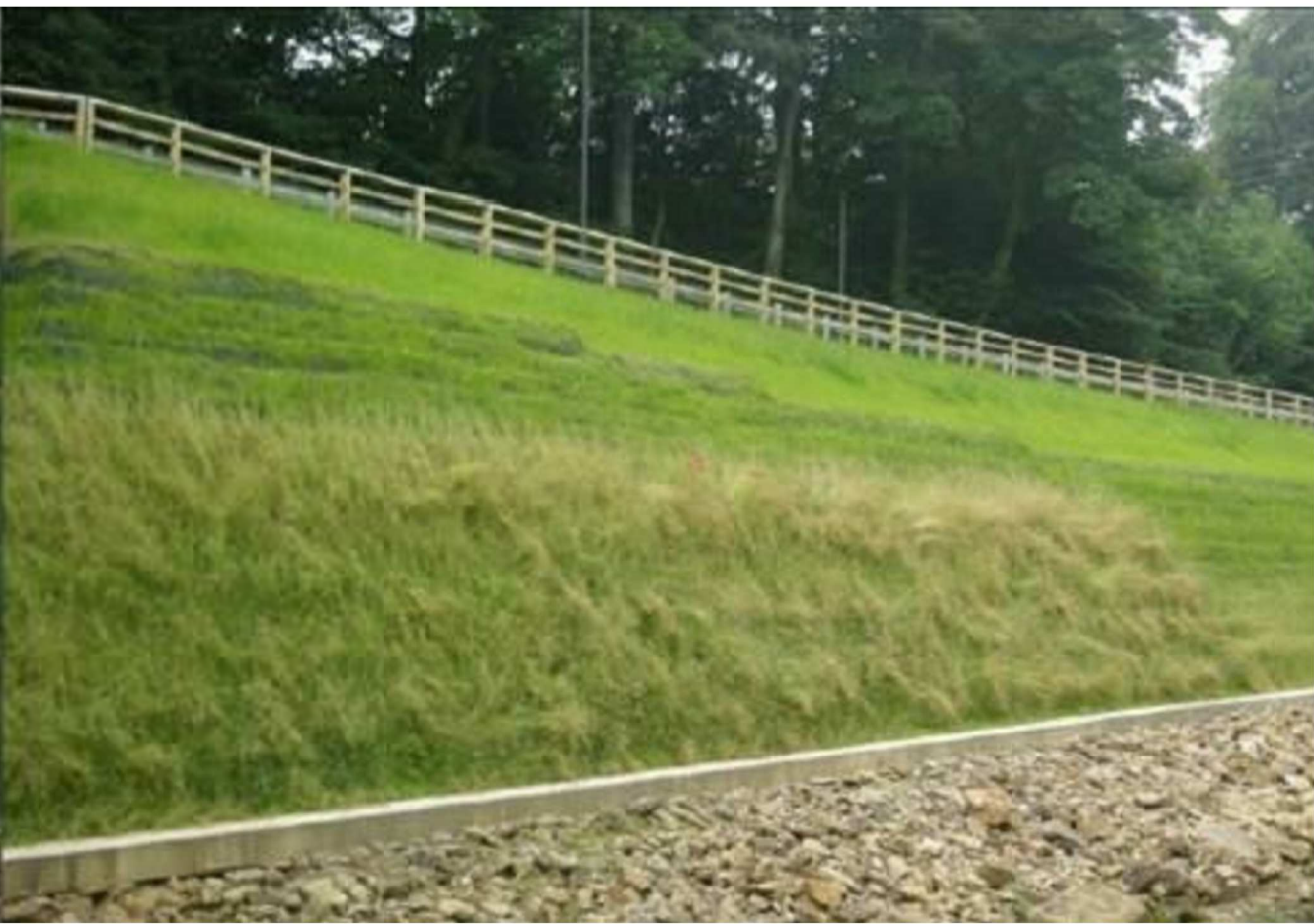
Example of reinforced soil slope